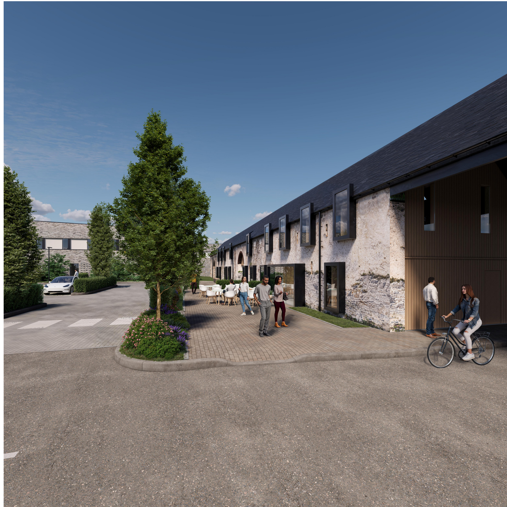
Consultant Building with Public Cafe

COPYRIGHT: The design and details shown on this drawing are applicable to The Named Project only and may not be; reproduced, modified or relayed in whole or part or be used for any other project or purpose without the prior written permission of TOT Architects with whom copyright resides. DO NOT SCALE this drawing. Use figured dimensions only. The Contractor is responsible for checking all levels and dimensions on site prior to commencement of works. Any discrepancies are to be referred to the ARCHITECT. Drawings to be read in conjunction with all other Consultants Drawings & Specifications were relevant. Proprietary items shall be fixed in strict accordance with the Manufacturer's Instructions. Sizes of proprietary items shall be checked with Manufacturer.